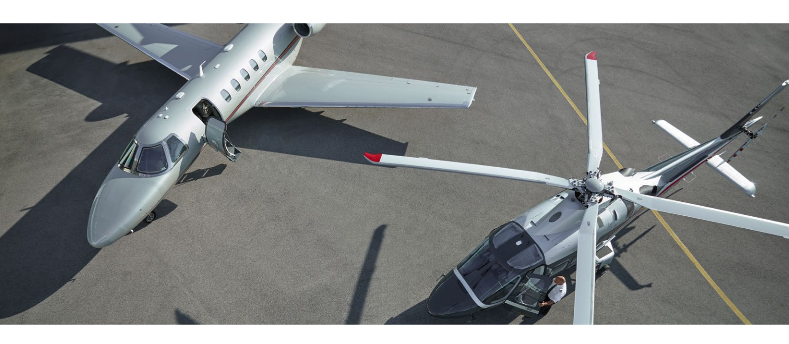
Private Aircraft Handling Service