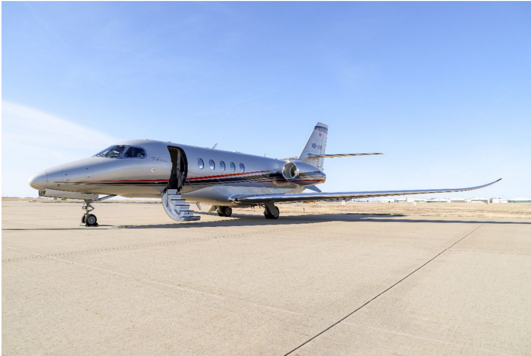
Latest addition to the BHS Aviation fleet: the Cessna Citation Latitude. (High resolution pictures available at https://bhs-aviation.com/en/news/press )